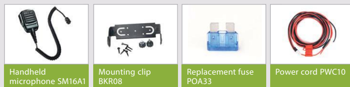
Handheld microphone SM16A1